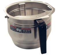
FUNNEL AY,W/DECAL GRT "C"7.62